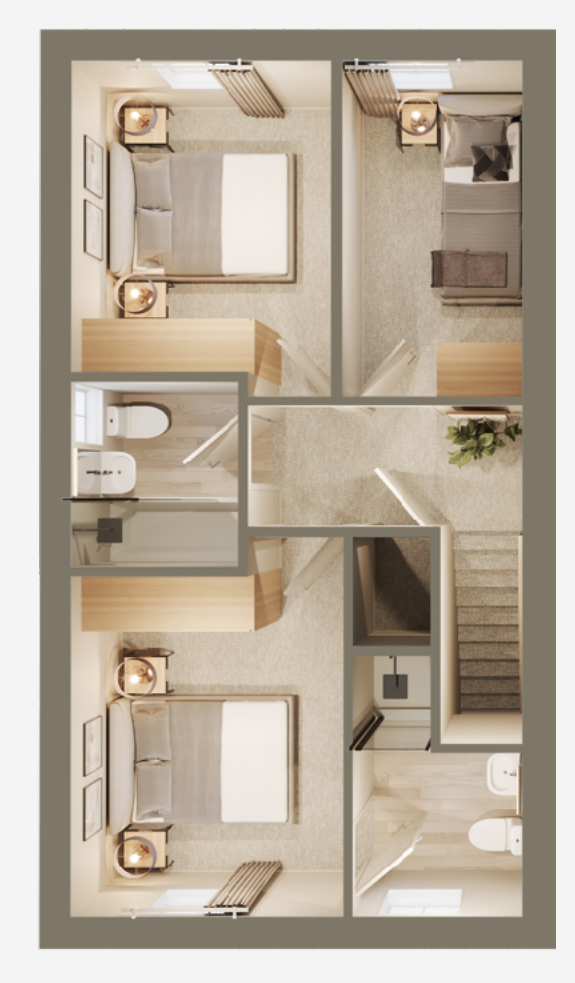
TOTAL 911 sq. ft.